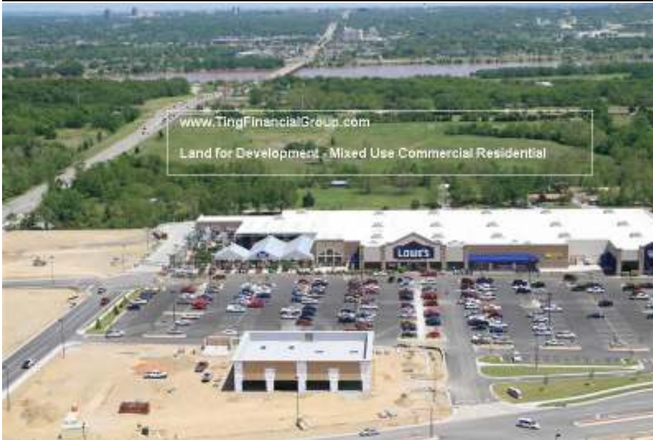
above: aerial view of Elwood Square

4815 S. Harvard Ave. Suite 265 Tulsa, OK 74135