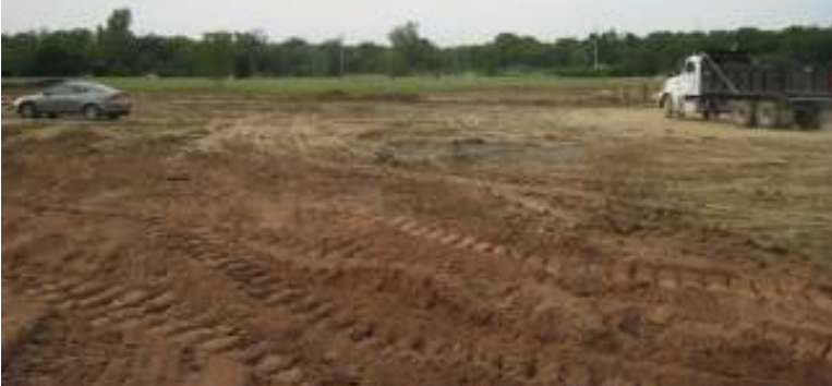
below: view from property to frontage on 71st Street